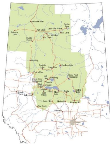
Diagram 2 - Catchment area of Northern Lakes College

The catchment area for Northern Lakes College includes: the town of Peace River, MacKenzie County; MD of Smoky River; MD of Big Lakes: Northern Sunrise County; MD Lesser Slave River; MD of Opportunity; County of Athabasca; part of Woodlands County; and the other towns, villages, and hamlets within the area. This is shown in Diagram 2.