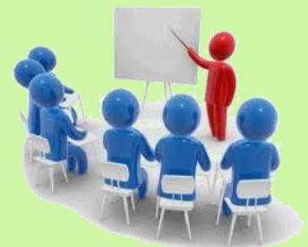
Number of Responsive Behaviour Symposia